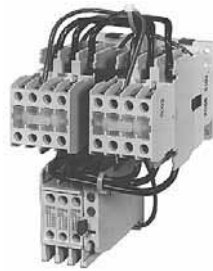
IEC Size F Cat. No. AE56DN0BC